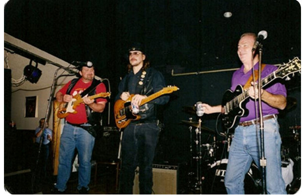
New Photo 1